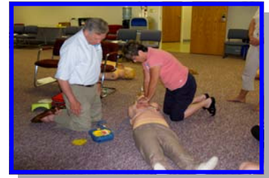
Above: Local community members learning and practicing life saving skills.

Beyond high-quality CPR, there are many new pieces of equipment and procedures that may be beneficial to cardiac arrest and critically ill patients. Within the guidelines are varying levels of evidence and recommendations regarding the various equipment (or procedures) available to healthcare providers. While some of the recommendations are not appropriate to EMS care, many of them are. We